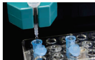
Figure 1 . Device for sperm isolation using MACs

The overall pregnancy rate of the S-ICSI group was lower than the O-ICSI group (P=0.005X). When S-ICSI and O-ICSI cohorts were compared, the pregnancy rate was higher (P=0.005X) for subgroups where the SDF was less than 50%. Abortion was not detected in those females receiving MACs treated sperm. Pregnancy and abortion rate for all groups are reported in Figure 2.